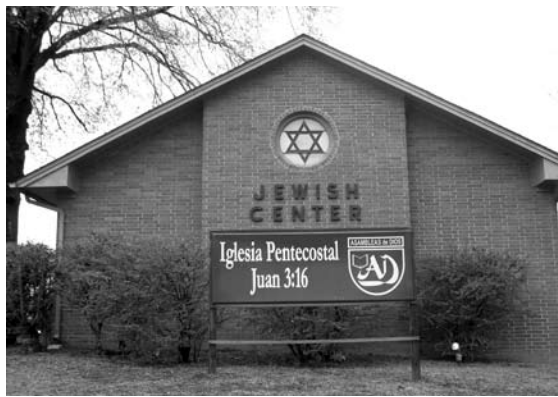
The Jewish Center of Union City closed in 2004, and is now rented by a Christian congregation.