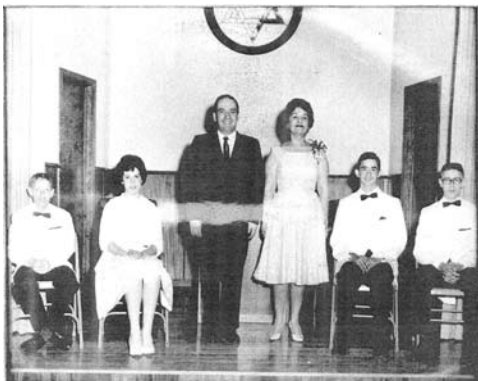
Union City Jews celebrate confirmation on the new building's stage before it became a sanctuary bimah.

According to its charter, the Jewish Center was to be used as a religious, educational, and social facility for the area's Jews. In most communities, Jews organized a congregation first, and then built or acquired a building; in Union City, it was the opposite: the build-